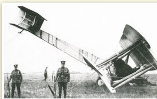
Armed soldiers guard Alcock & Brown's Vimy aircraft where it touched down in Derrygimla bog. The 16-hour flight from Newfoundland secured the aviators their place in history.

Ireland has contributed to no less than 50 firsts in Aviation, You can find out more on the weekend of 28th and 29 th August at our Celebration of Aviation Weekend